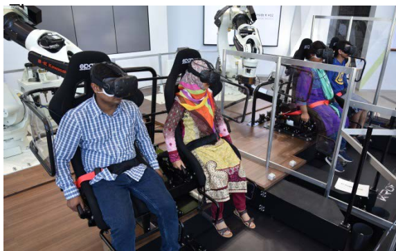
VR attraction K-Roboride

Specially, the VR attraction, Portrait Robot and " K-Roboride " are enthusiastically attracting visitors. To date, 20,000 persons took their nice portrait back home. Another 21,000 persons enjoyed the VR flights of K-Roboride. Children from 7 to 13 years old can now get on board if their guardian approves.