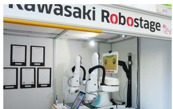
Portrait robot: Take your portrait home